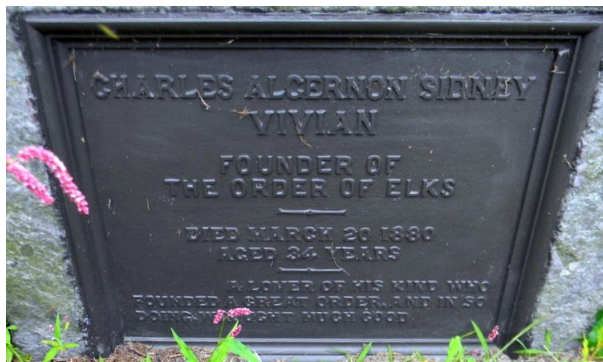
His grave marker reads, "A lover of his kind who founded a great order and in so doing wrought much good."