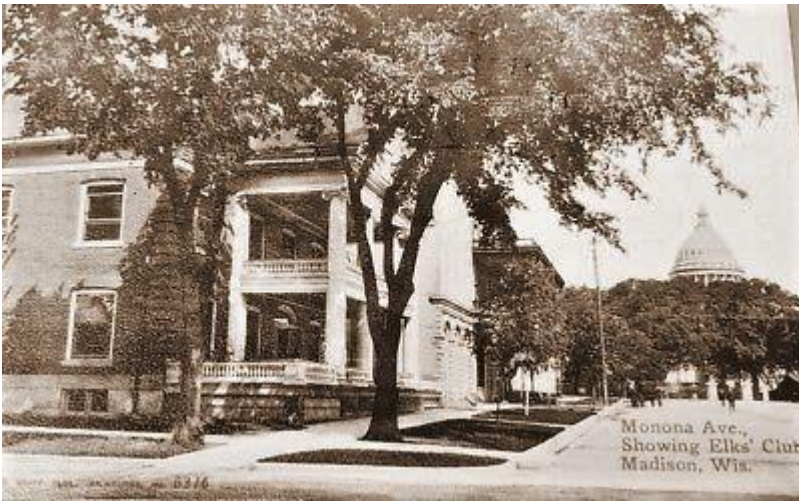
The old Lodge on Monona Ave. (Martin Luther King, Jr., Blvd.) as seen from Doty St. in 1911.