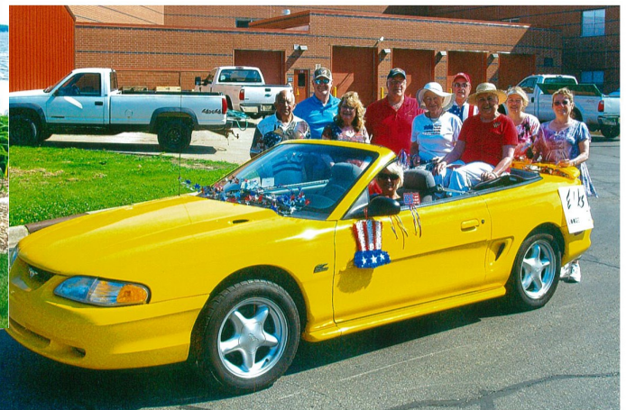
The Monona Memorial Day Parade Crew