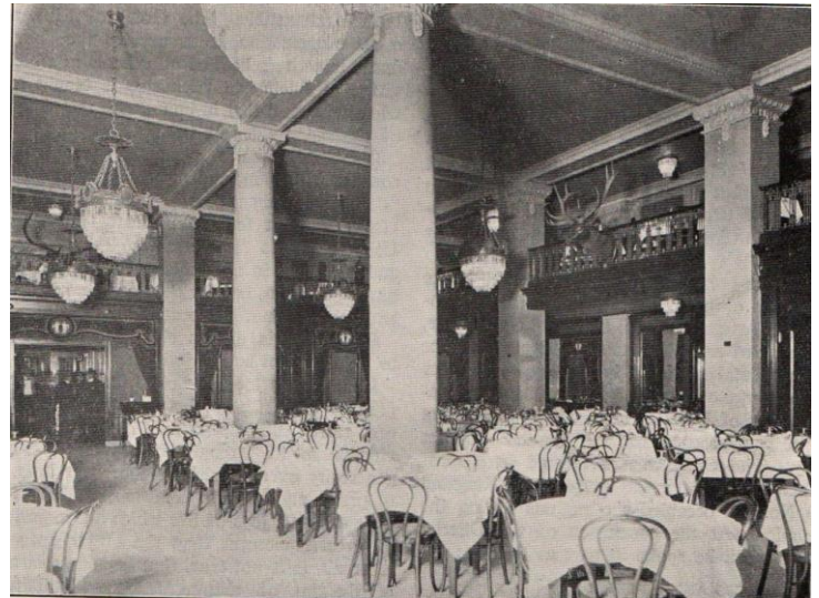
The Dining Hall at the Mother Lodge pictured shortly after it opened.